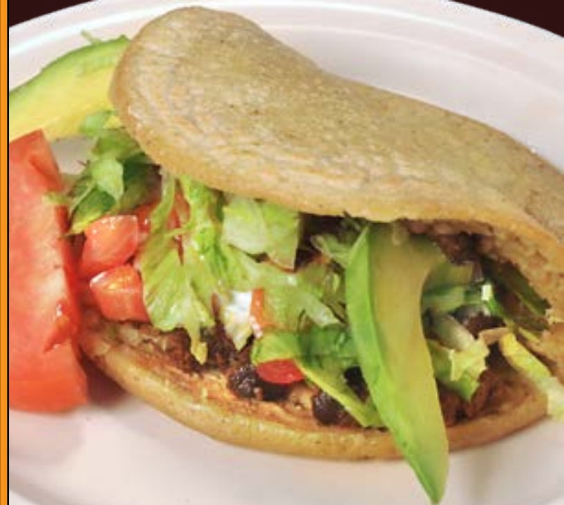
TACO DINNER (Steak)