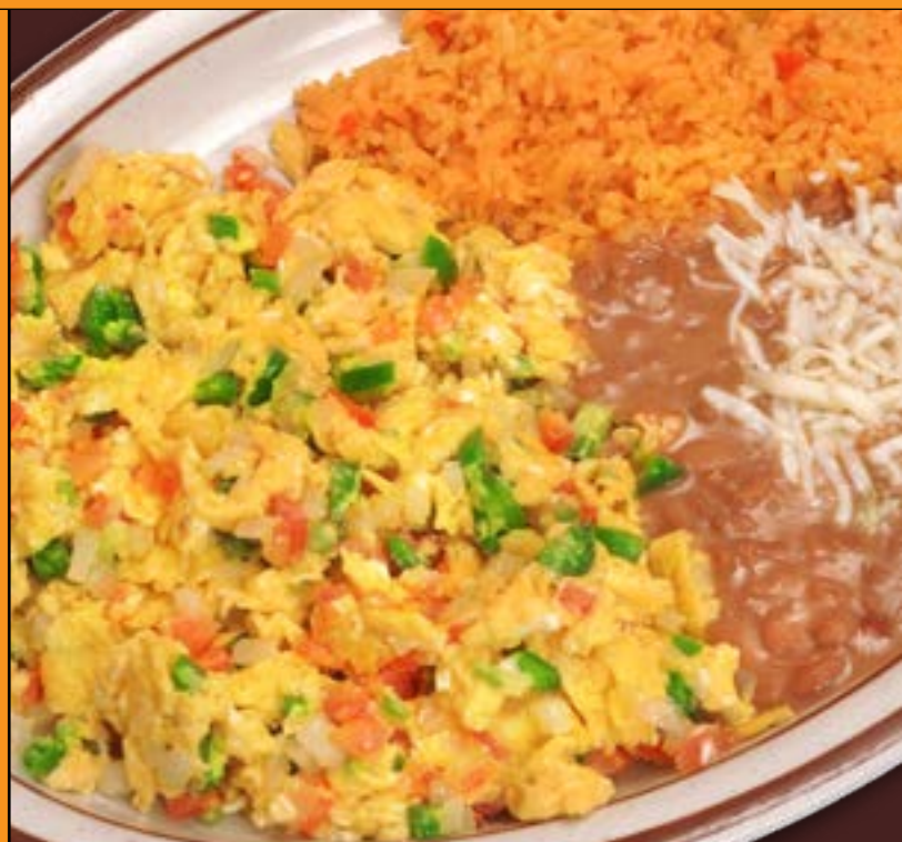
Huevos A La Mexicana