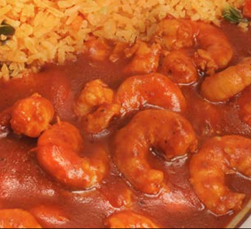
Camarones a la Diabla