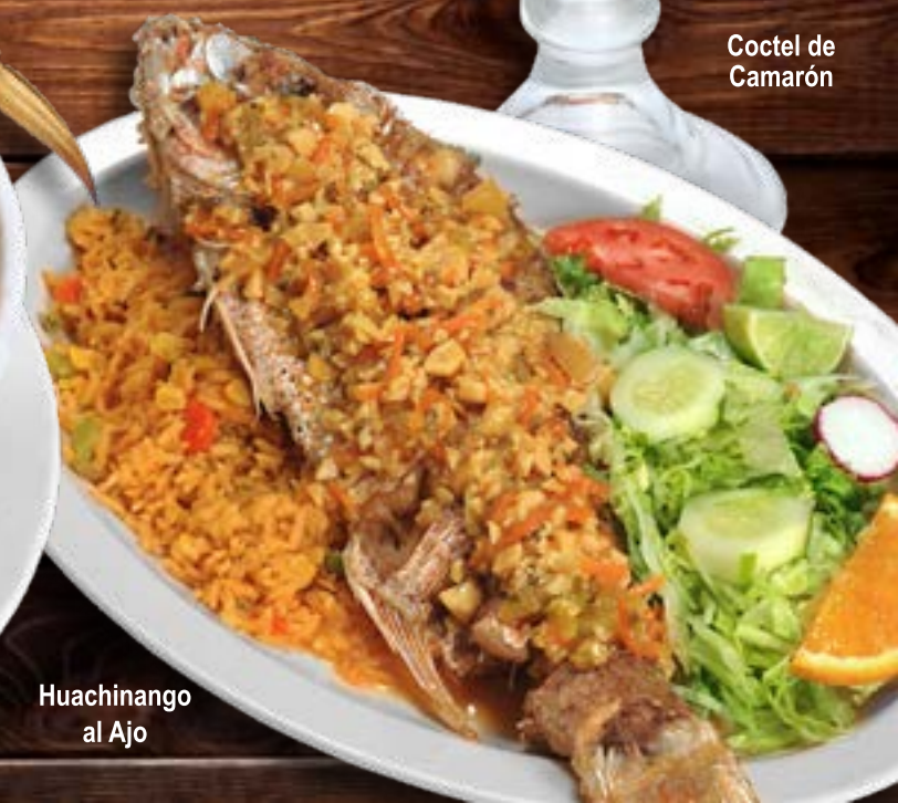
Huachinango al Ajo