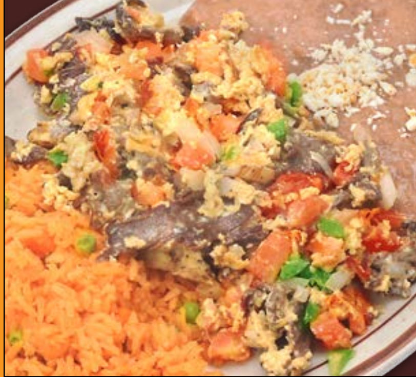
Machaca Con Huevo