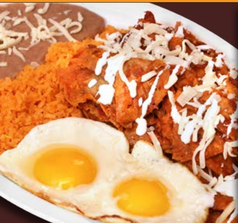
Chilaquiles Con Huevos