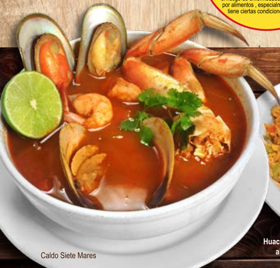
Caldo Siete Mares