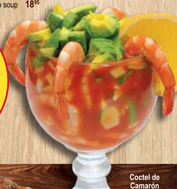
Coctel de Camarón

Los artículos marcados con un asterisco (*) se sirven crudos o poco cocidos. El consumo de alimentos crudos o poco cocidos de carne, aves, mariscos o huevos puede aumentar el riesgo de enfermedades transmitidas por alimentos, especialmente si usted tiene ciertas condiciones médicas