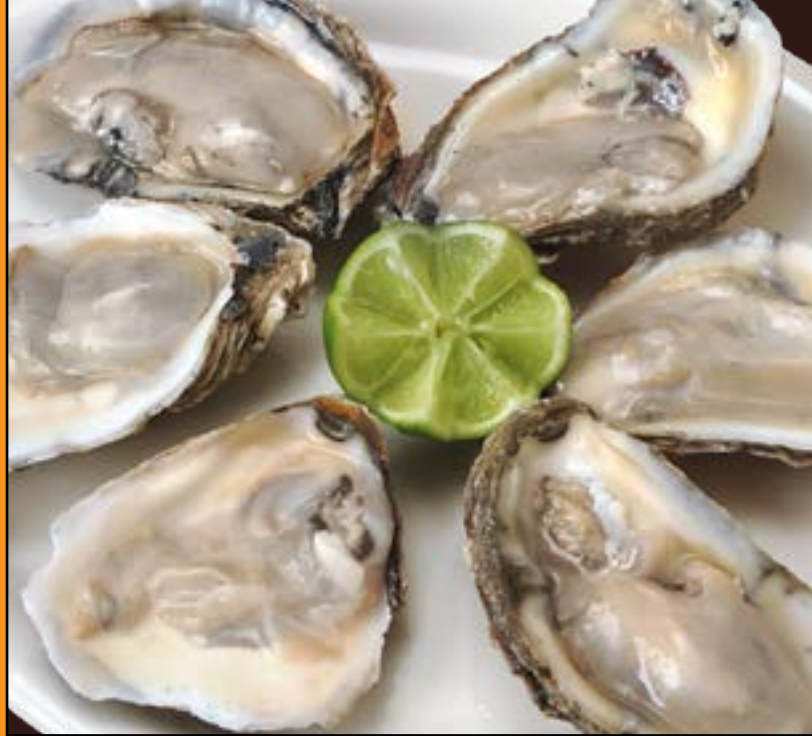
Ostones en su Concha